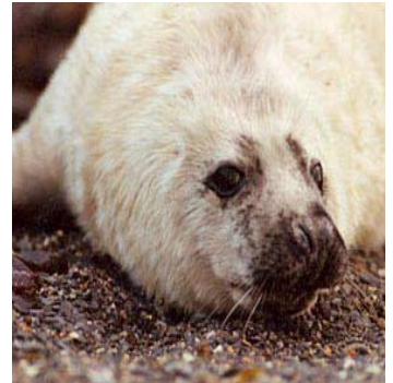
Grey Seal Pup

Never approach a seal pup if you see one alone on a beach. Mother seals rarely abandon or travel far from their pups and will keep a watchful eye even when they are in the water. If you get too close the mother seal may attack to defend her young and the pup may bite you or become distressed and may injure itself getting away from you.