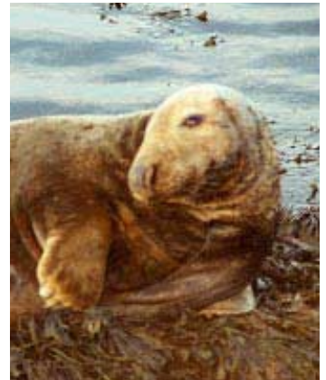
Adult Grey Seal