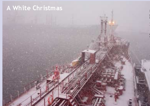
A White Christmas