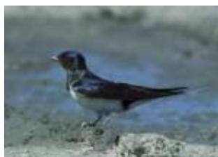
Above: Swallow; Left: Swift (Front Page: Cuckoo)

To help you get to know as much as you can about the four species covered by the project, key information about them is available at www.springalive.net , including photos, sound recordings, video clips, and interactive games. The scheme makes an ideal project for schools, and is perfect for kids (and adults) of all ages.