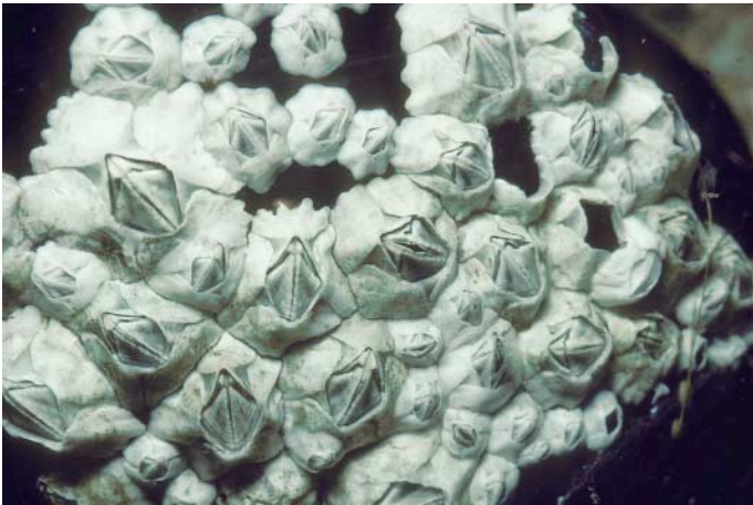
The Acorn Barnacle: Barnacles are usually found on the middle and lower shores where they can filter feed when covered with the tide.